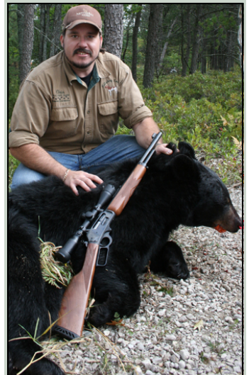
225lbs Black Bear 2009

With the success of Chris Gregorek in the 2009 Bear season. Bear hunts are now available at NettieBay Lodge. Be sure to apply for your 2010 bear tag.